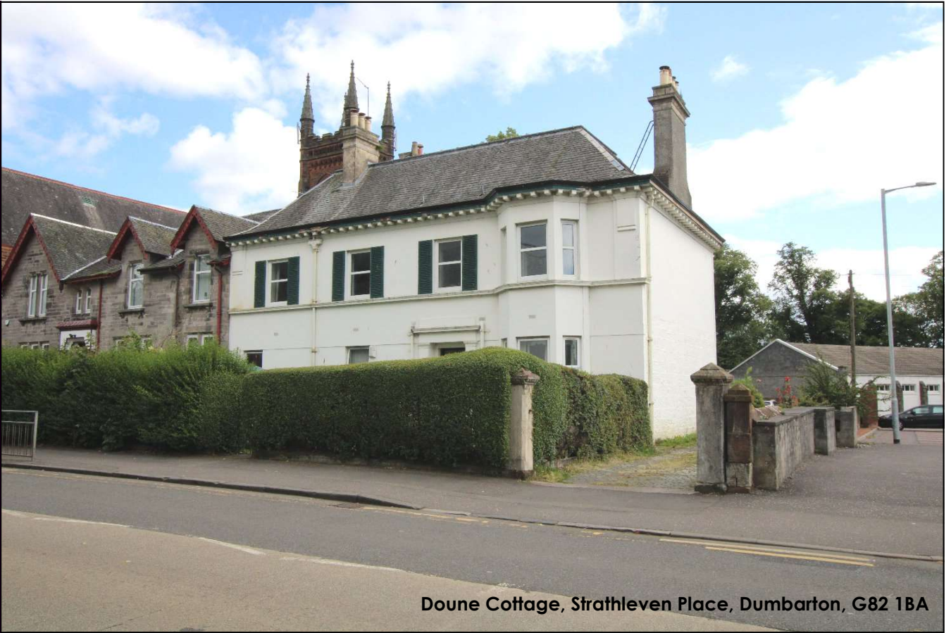
Doune Cottage, Strathleven Place, Dumbarton, G82 1BA

The agent offers to the market a unique style of property which is certain to catch the attention of a wide range of buyers. Purpose built as a 4 bedroom upper flat circa 1895 the commodious apartments on show offer versatility in their use.